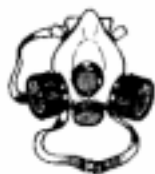
HALF-FACE PARTICULATE FILTER (CARTRIDGE) RESPIRATOR