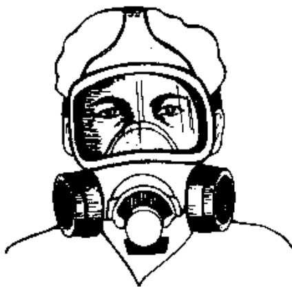
FULL-FACE, PARTICULATE FILTER (CARTRIDGE) RESPIRATOR