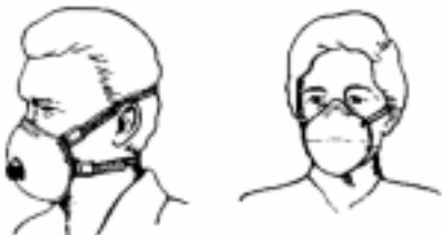
DISPOSABLE HALF-FACE PARTICULATE RESPIRATORS