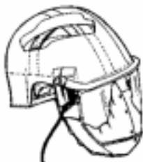
POWERED, AIR-PURIFYING, VENTILATED HELMET RESPIRATOR